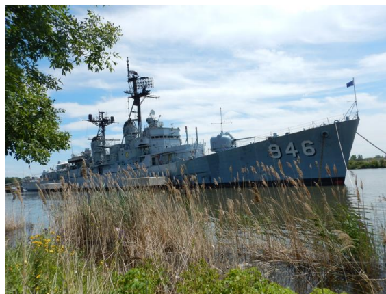
USS Edson DD 946