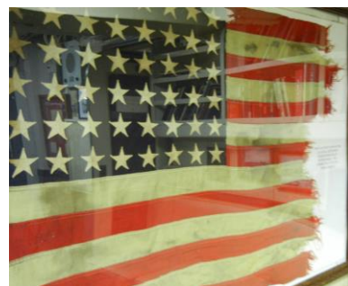
Flag from USS Selfridge

Grant Camp has the unusual distinction of being the only Camp in the Department of Michigan to meet in a saloon. Now with the meeting held on the Edson , Grant Camp can lay claim to the Camp with the most firewater and the most fire power .