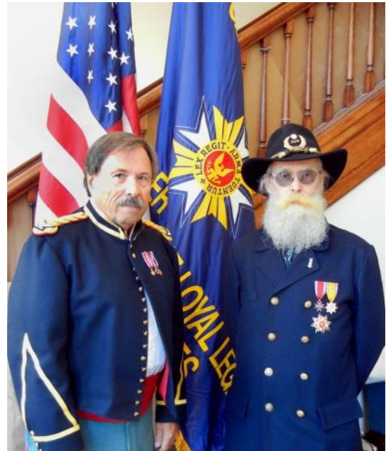
Members of MOLLUS, the Allied Orders and distinguished guests at the GAR hall open house in October