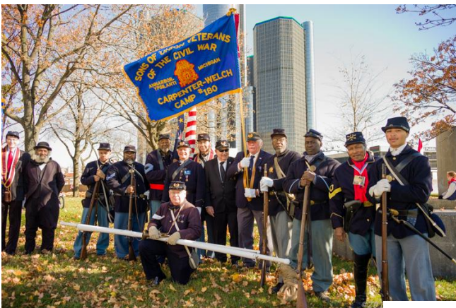
After the parade at Hart Plaza: 102nd US Colored Troop and SUVCW parade participants

During staging for the parade, we noticed that members of the 102nd US Colored Troops Co B Black History Group were staging nearby. With agreement & permission, we arranged to have our SUVCW group and the 102nd group proceed in the parade one behind the other.