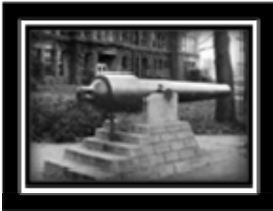
Original mounting at Niles Central School 1898 to ?