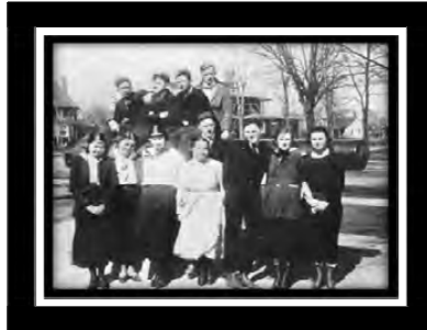
From a 1920's Niles Central Tattler Yearbook. (Students sitting on and standing in front of cannon.)