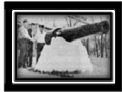
New location at the American Legion Post 26 1962 to 2009