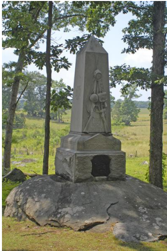
The 1st Michigan Volunteer Infantry Monument at Gettysburg Battlefield, Pennsylvania

The 1st Michigan Infantry was organized at Detroit, Michigan and mustered into Federal service for a three year enlistment on September 16, 1861. This regiment retained a number of the original 1st Michigan raised for a three month enlistment, particularly the officers. The regiment was mustered out on July 19, 1865. The regiment was given to Captain John C. Robinson of the US Army, who was made Colonel of Volunteers.