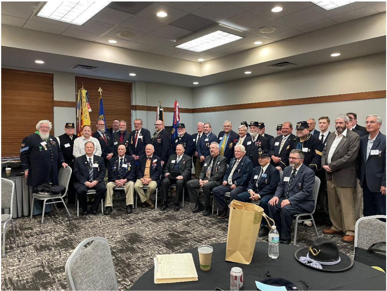
Brothers attending the Encampment