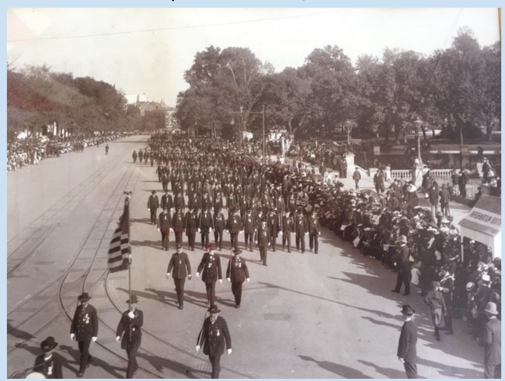
G A R parade on Pennsylvania Avenue in Washington DC, September, 1892