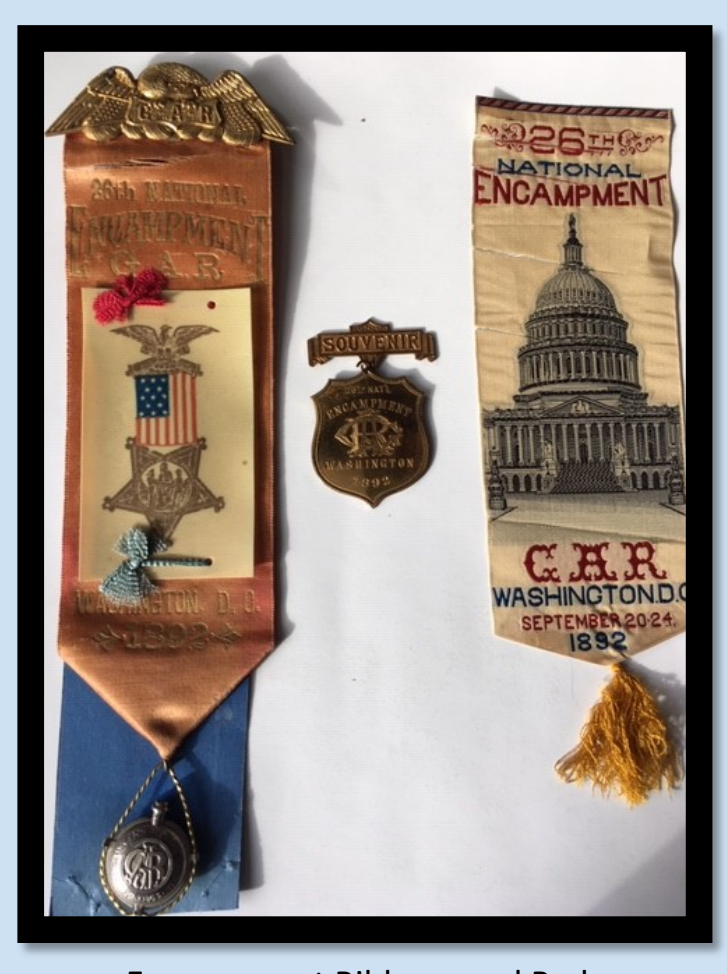
Encampment Ribbons and Badges