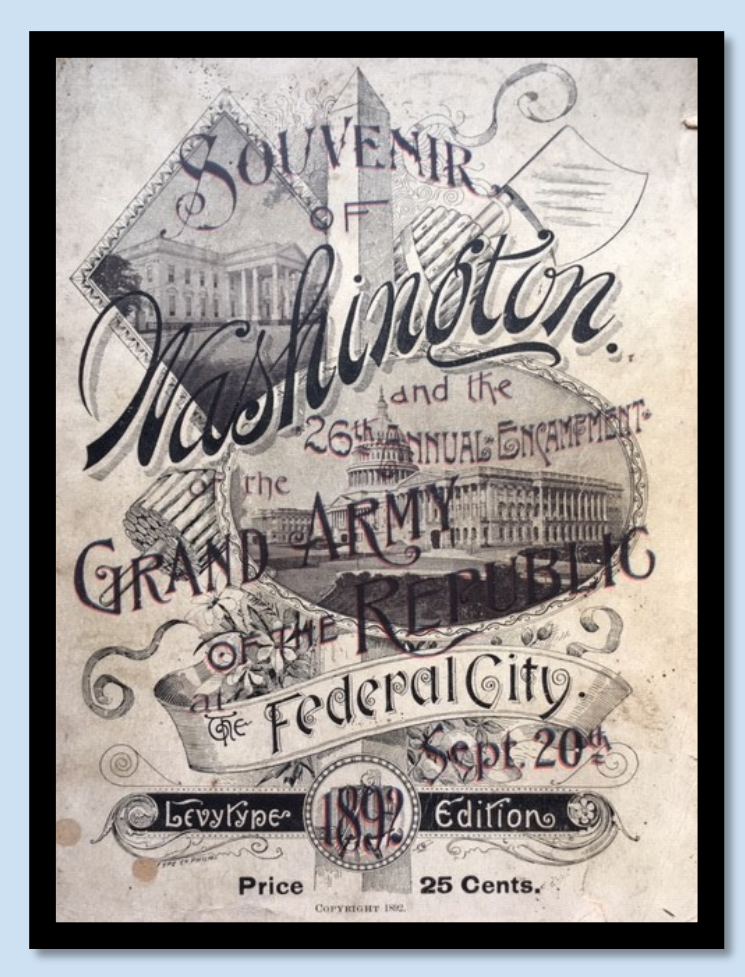
1892 Encampment Program