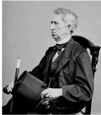
William H. Seward (1801–1872) (c. 1860–1865)

Europe were chosen for political and personal reasons—not for their diplomatic potential. This was due, in part, to the belief that cotton could accomplish the Confederate objectives with little help from Confederate diplomats.