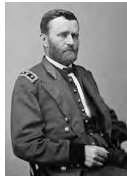
Brig Gen Grant