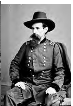
Brig Gen Lew Wallace