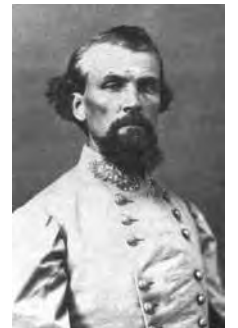
Lt. Col. Nathan Bedford Forrest