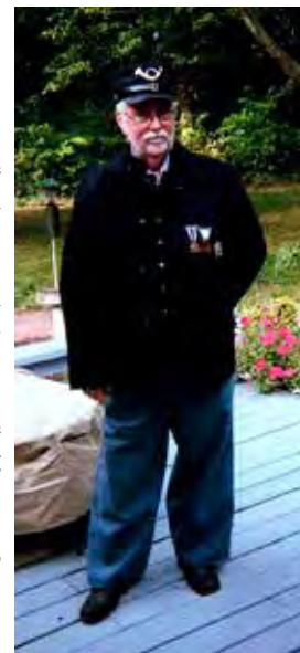
Commander to Page 5

(4) Three Oaks Flag Day parade. Unfortunately, I will be out of town from the 13th to the 20th and not with you at the parade. So we will need to make arrangements at a meeting for the who the coordinator will