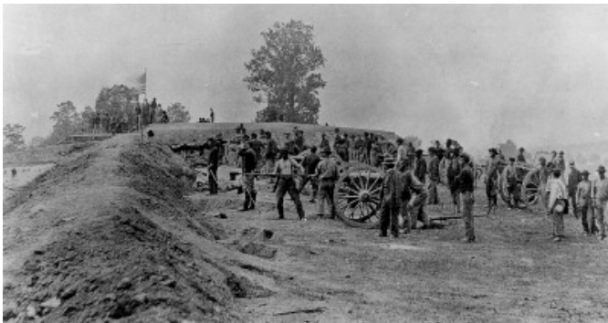
Hatcher's Run - Confederate Battery