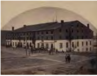
Libby Prison - Richmond VA