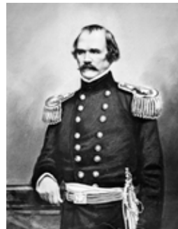
Gen Albert Sidney Johnston