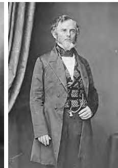
Brig Gen Gideon J Pillow