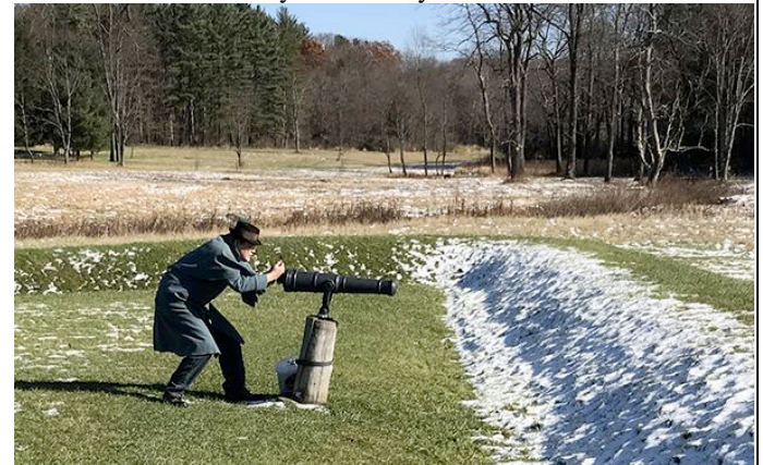
Irish manned the cannon in an effort to keep the French away.