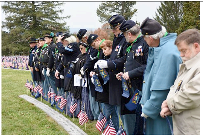
A moment of silence for Michigan Soldiers, Gettysburg Remembrance 2017.