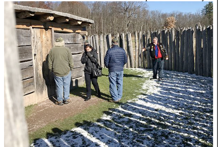
Snow "cannon balls" were flying in all directions.